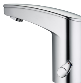
Temperature adjustment lever