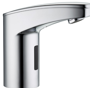
WSH 20 AU